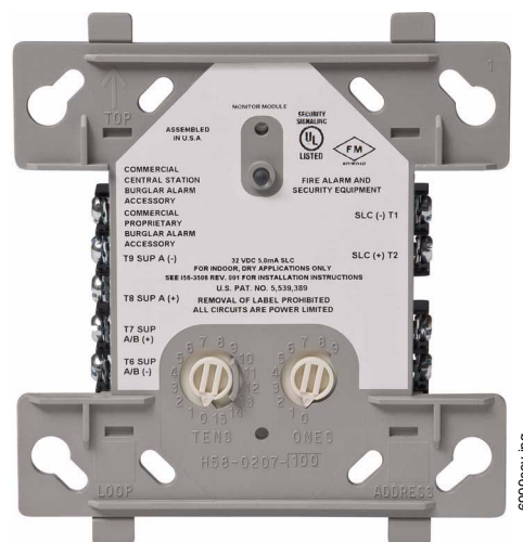
FMM-1(A) (Type H)

Use to monitor a zone of four-wire smoke detectors, manual fire alarm pull stations, waterflow devices, or other normally-open dry-contact alarm activation devices. May also be used to monitor normally-open supervisory devices with special supervisory indication at the control panel. Monitored circuit may be wired as an NFPA Style B (Class B) or Style D (Class